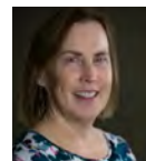
Julie Maitland Mayor, Village of Hazelton Appointed Regional Representative Kitimat-Stikine Regional District