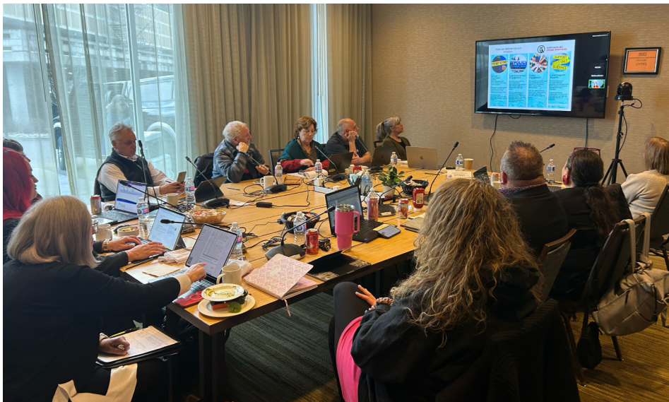
BELOW: November 29, 2025, Board Meeting.

The NCLGA Board of Directors met for their regular Board Meeting on November 28 and 29, 2025, in Prince George, BC. A Presidents report and Director roundtable updates were provided, alongside Committee updates and discussions on Advocacy activities.