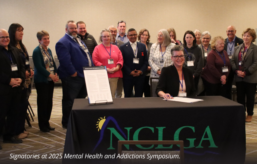
Signatories at 2025 Mental Health and Addictions Symposium.