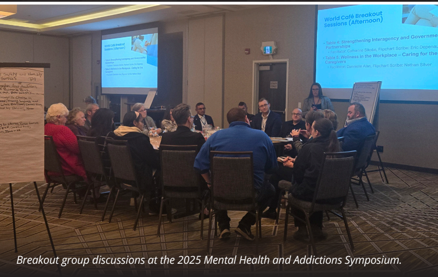
Breakout group discussions at the 2025 Mental Health and Addictions Symposium.